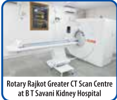
Rotary Rajkot Greater CT Scan Centre at B T Savani Kidney Hospital